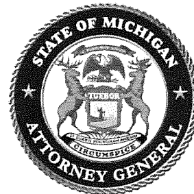
Bill Schuette, Attorney General